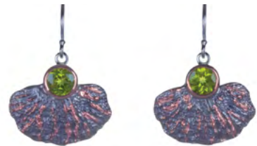
'Coral Garden' earrings with black rhodium finish and rose gold accents

Gemstone options: Blue topaz; peridot; amethyst - $260 Australian doublet opal - $280