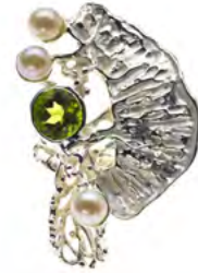
'Coral Garden' ring with three white pearls and either amethyst, blue topaz, or peridot - $475

'Coral Garden' ring above with rose gold accents - $495