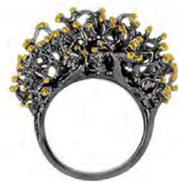
'Fragments' ring with black rhodium finish and yellow gold accents - $470