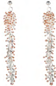
'Anemone' long drops with rose gold accents - $410