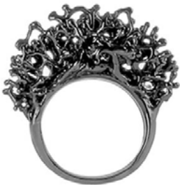
'Fragments' ring with black rhodium finish - $440