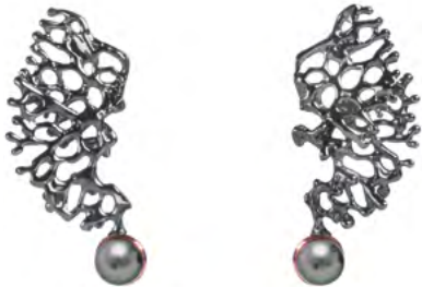
'Fragments' earrings with black rhodium finish and rose gold or yellow gold accents, black pearl - $275