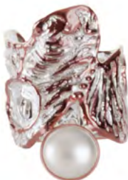
'Ocean Bed' statement ring with rose gold accents, white pearl - $395

Gemstone options: Blue topaz; peridot; amethyst - $320