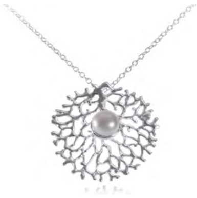
'Fan of the Sea' medium pendant, white pearl - $265

'Coral Garden' ring above with rose gold accents - $495