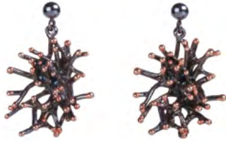
'Anemone' short drops with black rhodium finish and rose gold or yellow gold accents - $260