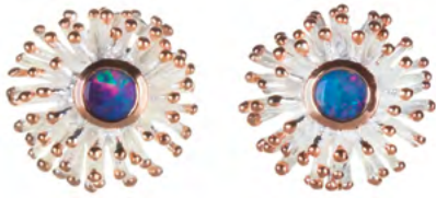
'Anemone' large studs with rose gold accents