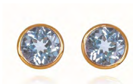
'Spirit of the Sea' medium studs with black rhodium finish and yellow gold accents

Gemstone options: Blue topaz; peridot; amethyst - $320