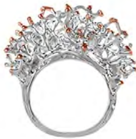
'Fragments' ring with rose gold accents $440