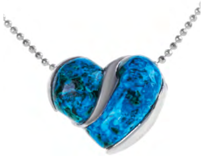
The original 'Heart Reef' 'Love thy Ocean' chrysocolla pendant - $450