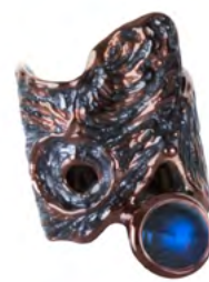
'Ocean Bed' statement ring with black rhodium finish and rose gold accents, labradorite - $430