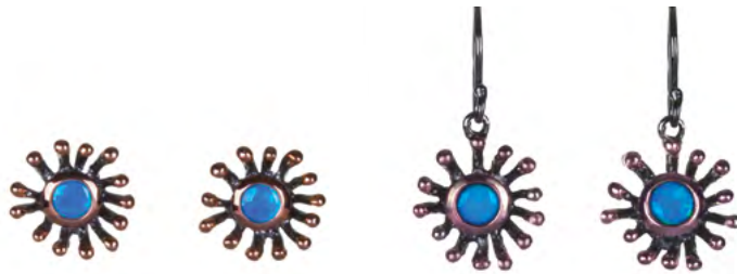
'Anemone' small studs or drops with black rhodium finish and rose gold or yellow gold accents, Australian doublet opal - $270