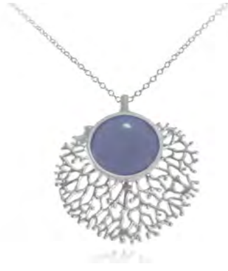
'Fan of the Sea' medium pendant, blue chalcedony - $370

'Fan of the Sea' pendant above with rose gold accents - $295