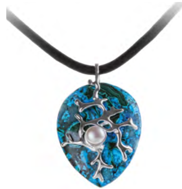
'Love thy Ocean' chrysocolla droplet pendant, white pearl - $460