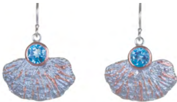
'Coral Garden' earrings with rose gold accents

Gemstone options: Blue topaz; peridot; amethyst - $260 Australian doublet opal - $280