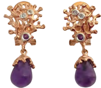
'Fragments' earrings with rose gold finish featuring amethyst drops with amethyst and peridot - $450