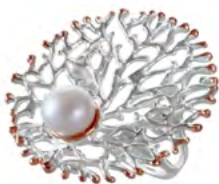
'Fan of the Sea' statement ring with rose gold accents, white pearl - $390